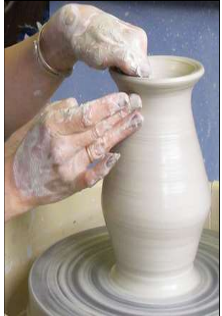
Romans 9:19 - 23